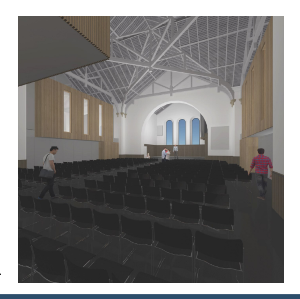
Illustration courtesy of LDN Architects

Concept illustration of auditorium post redevelopment